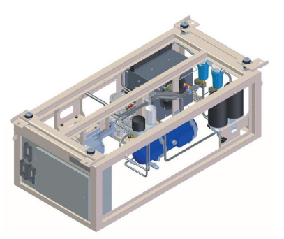
• Metro MRT – Malaysia TA 6 / 7.5 kW / 550 l/min / 10 bar