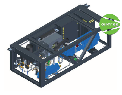
• Metrorail – South Africa TA 8 / 9 kW / 920 l/min / 10 bar